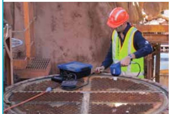
Fast, accurate inspection of heat exchanger tubes