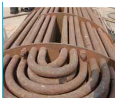
Inspection of any tube shape or material

Dolphin G3™ presents an easy-to-read online report (with drill down options) to the technician for verification, as well as a final summary report including tabular reporting and screenshots of the detected flaws in PDF or HTML format.