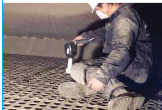
Large diameter tube inspection in industrial boilers