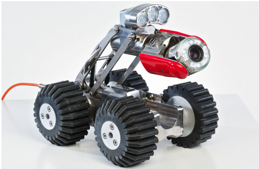
Typical Inspection Camera with Crawler

The Laser Profiler is a stand-alone tool for use with a closed circuit television video (CCTV) survey system to collect survey data and create pipeline reports using innovative machine vision software to obtain the measurements of faults and features inside the pipeline. This includes measurements of pipe size, water levels, cracking, and hydraulic capacity.