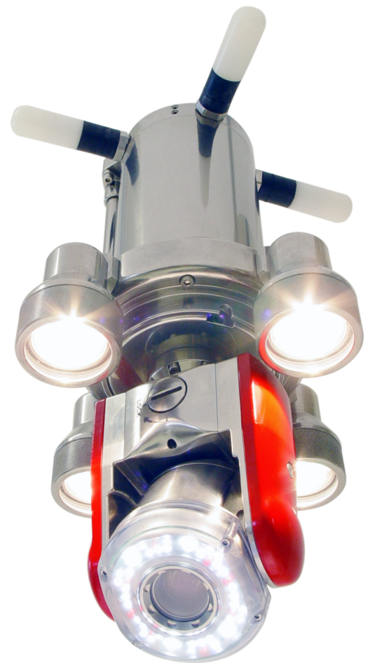
Deep Well Rotation Unit

The Laser Circle Viewer Technology is developed for commercial use of pipe inspection in combination with